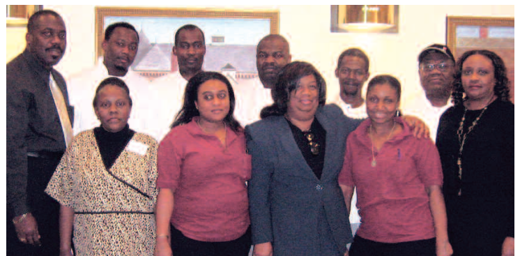
Orchard Cove Staff gain comfort from fellow co-workers & friends.

It was comforting to welcome families and friends who joined us in support of those in a state of bereavement and anxiety.